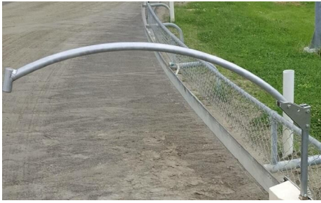
New extended lure arm at Christchurch track - in race day operation from 28 May 2019.

Another initiative that has significant animal welfare and safety benefits has been the introduction of safety pads around the outside racing fence. Again, GRNZ has been successful in an application to the Ministers Racing Safety Development Fund for the extension of these pads at the Wanganui and Manawatu tracks. Each track has had a further 50m of pads fitted to the areas where they were most exposed, meaning that the racing dogs race experience has been greatly improved.