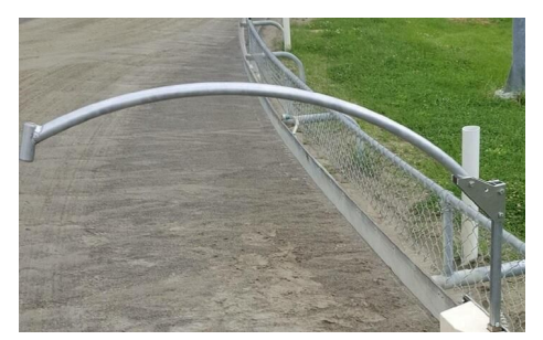
New extended lure arm at Christchurch track - in race day operation from 28 May 2019.

Another initiative that has significant animal welfare and safety benefits has been the introduction of safety pads around the outside racing fence. Again, GRNZ has been successful in an application to the Ministers Racing Safety Development Fund for the extension of these pads at the Wanganui and Manawatu tracks. Each track has had a further 50m of pads fitted to the areas where they were most exposed, meaning that the racing dogs race experience has been greatly improved.